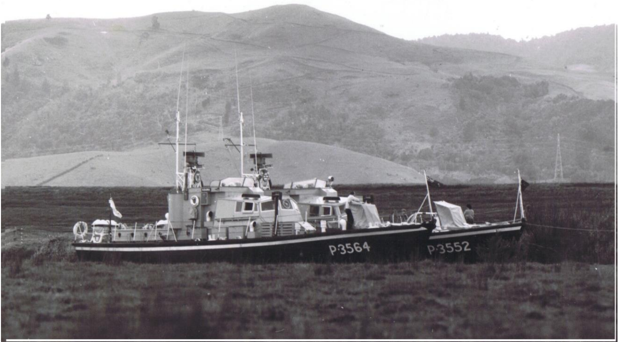
HMNZS Koura with HMNZS Paea at Paeroa