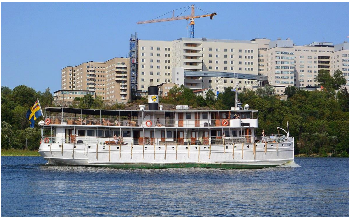
M/S JUNO is the world's oldest registered (overnight) cruising ship, built at the Motala shipyard and launched in 1874.