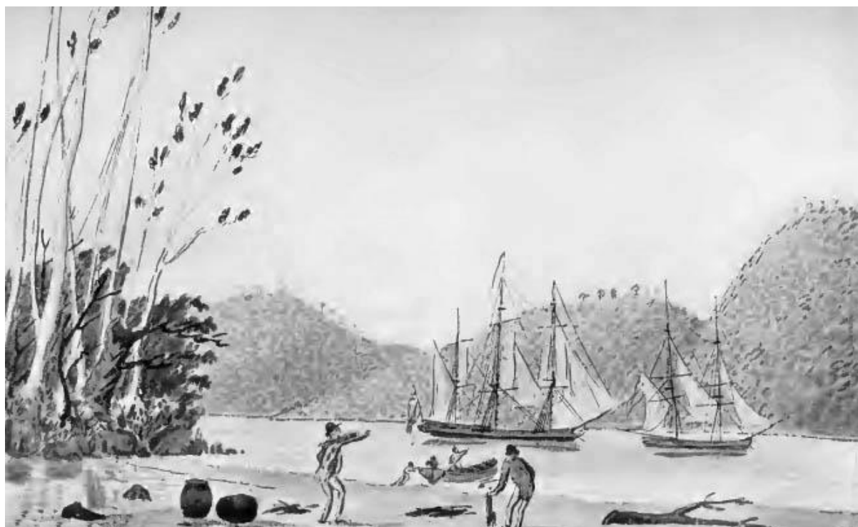
HMS Providence and Assistant in Tahiti