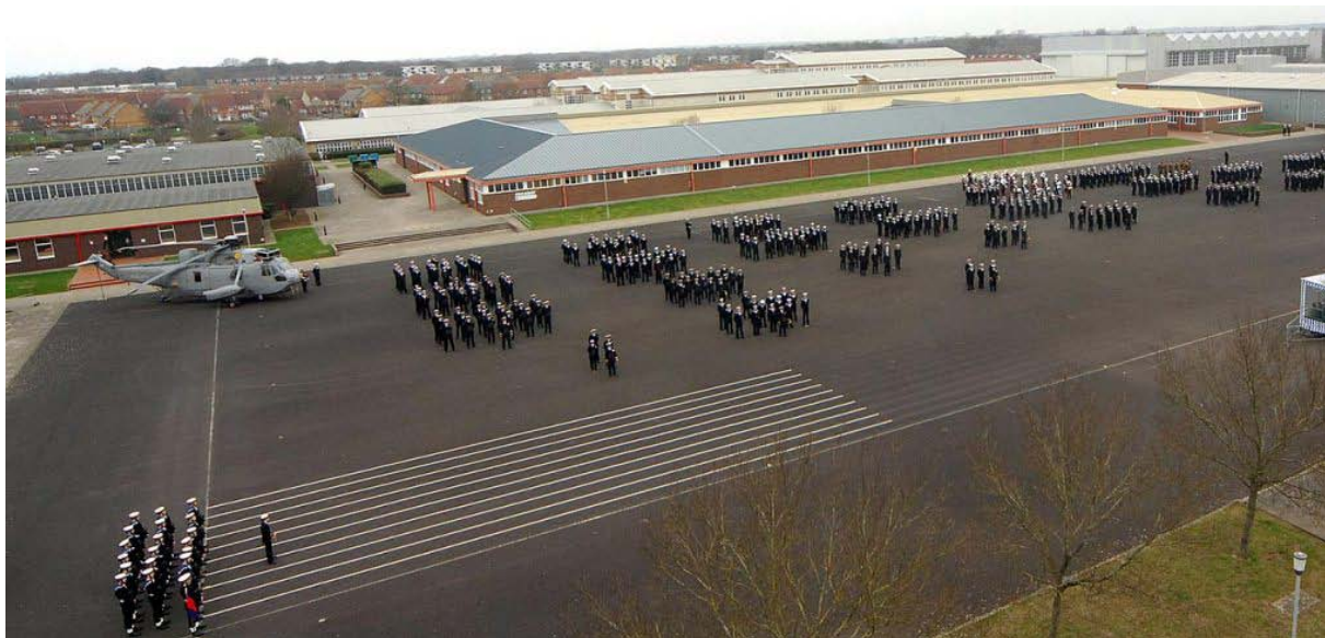
Divisions, HMS Sultan

It was announced last November that HMS Sultan in Gosport will close in 2025. Most of Sultan's functions will be transferred to HMS Collingwood in Fareham.